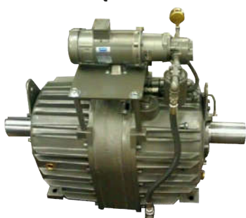
POSIDYNE CLUTCH BRAKE