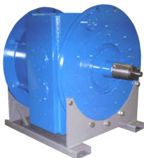
POSITORQ WINCH BRAKE