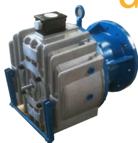
MAGNASHEAR MOTOR BRAKE