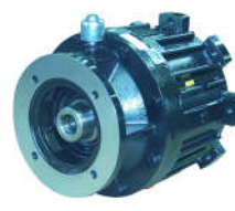
Posistop X Class

Spring Set—Air Release Custom Air Coupler Brake