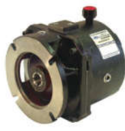
Posistop X Class

Spring Set—Air/Hyd. Release Motor Brakes