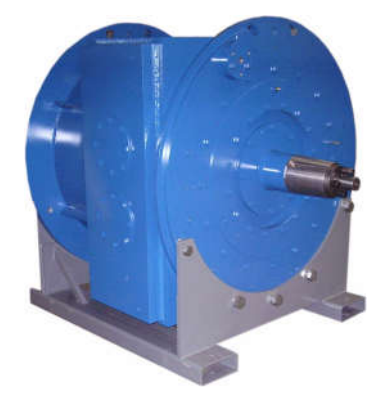
Positorq LCB TB-87