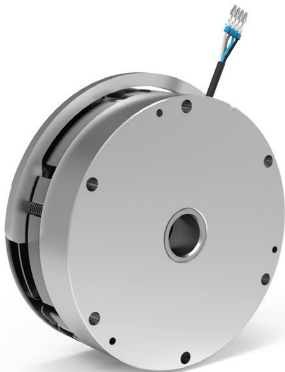
The CBTB family of electromagnetic axle brakes is specifically for use on battery-powered, dual-drive vehicles with capacities generally up to 8 tons.

Production stoppages at National Frozen Foods due to palletizer maintenance and repairs had company leaders concerned. The company packages high-quality frozen vegetables, like corn, green beans, peas, carrots, and more, into retail and foodservice containers. Just before they are shipped out, the packages, in sizes from 16 oz. to 5 lb. for retail customers, or from 10 kg to 55 lb. on the foodservice size, are placed onto pallets using palletizers. Running 18-hours a day for a minimum of 100 cycles per hour, the palletizers are a critical component. A motor and its brake engage each cycle to properly position the products on the pallets. But all shipping activity comes to a screeching halt when one of the motor brakes fail. When the production downtime began to cut into profits, Dan Snider, National Frozen Foods maintenance manager, looked for a solution that would keep production humming without breaking the budget.