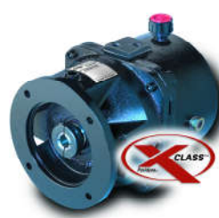
Posidyne X Class